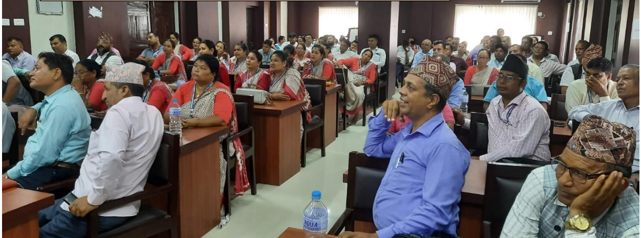
Men do like talking about Menstruation.