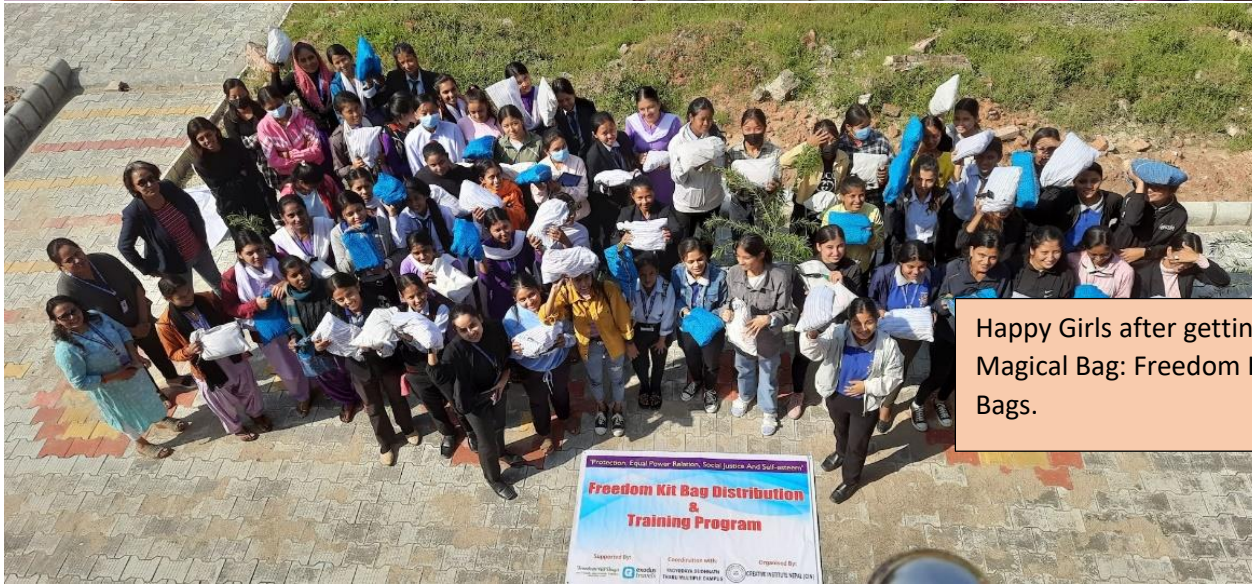
Happy Girls after getting Magical Bag: Freedom Kit Bags.