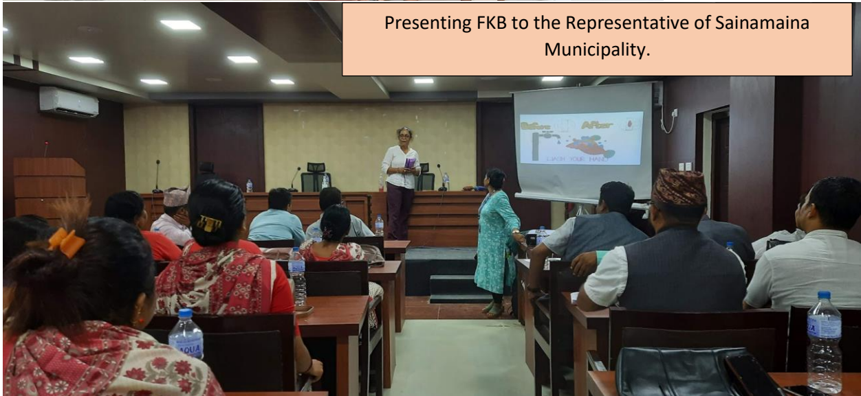
Presenting FKB to the Representative of Sainamaina Municipality.