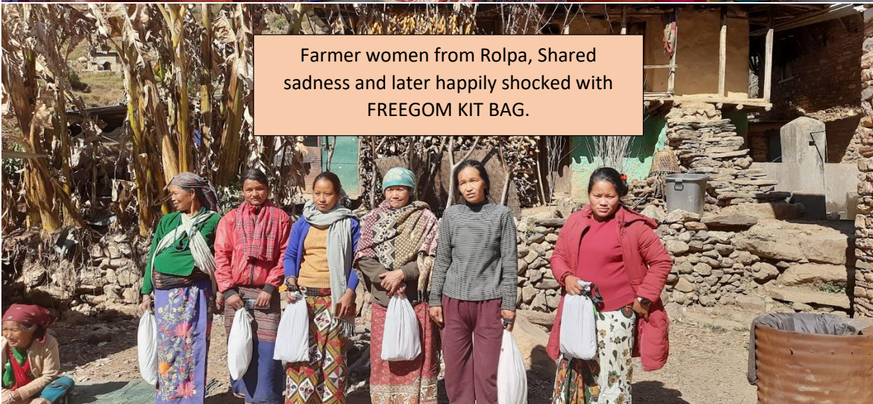
Farmer women from Rolpa, Shared sadness and later happily shocked with FREEGOM KIT BAG.