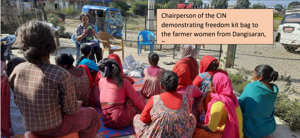
Chairperson of the CIN demonstrating freedom kit bag to the farmer women from Dangisaran,