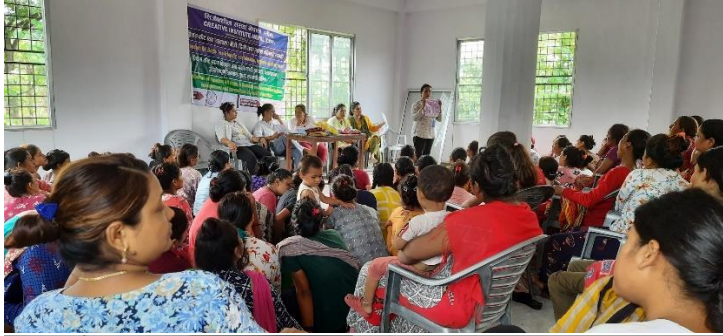
Distribution of Freedomkit Bags to the Dalit, Madhesi and Single women resides on slum area of Butwal Sub-Metropolitan City