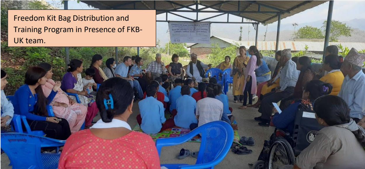
Freedom Kit Bag Distribution and Training Program in Presence of FKB-UK team.